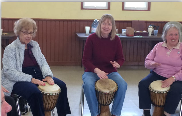
Comfort Café clients during a drumming workshop

The In-Home Visiting Program is HKARH's foundational program and offers support to individuals in their home—both the palliative client and their families. We play an important role on the inter-disciplinary care team which includes nurses, care coordinators, physicians, and other healthcare agencies.