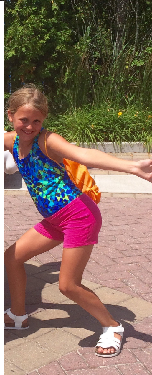
Grief Busters Summer Camp Kids

HOSPICE KING-AURORA (operating as HOSPICE KING-AURORA-RICHMOND HILL )