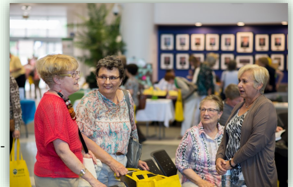
Participants at a Caregiver Event