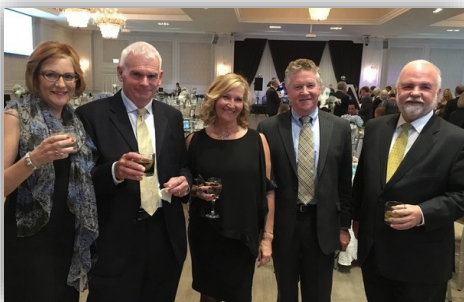
Jitterbug Ball Guests