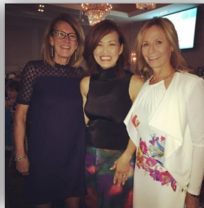
Jitterbug Ball Guests